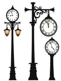
Do you have an hour to spare?

(continued on page 5, Annual Meeting Dinner Reservations)